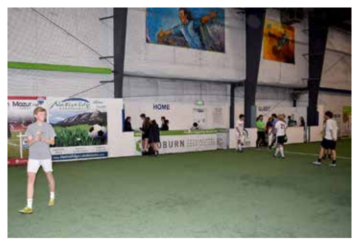
Co-ed players warming up and preparing for match action.