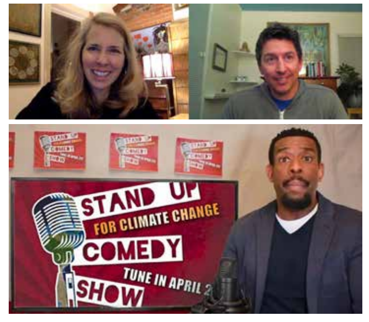
Top photo: 'Stand up for Climate' Comedy show co-hosts Beth Osnes and Max Boykoff. Bottom photo: Featured guest, celebrity comedian Chuck Nice. 4

If you missed the show you can view the archived event here: https://insidethegreenhouse.org/node/4701.